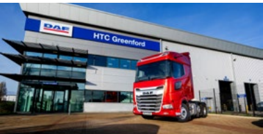
Greenford, United Kingdom