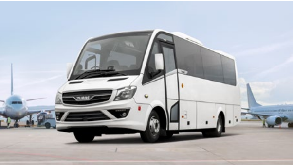
DAF introduced the versatile XB chassis for midi-bus applications. It is available with a wide selection of wheelbases and engine ratings, while offering class-leading maneuverability and comfort.

It is estimated that industry sales in the above 16-tonne truck market in Europe in 2025 will be in a range of 270,000-300,000 units. With a class-leading product range, top quality services and a strong dealer network, DAF is well positioned to further increase market share in the coming years.