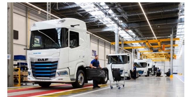
DAF opened an entirely new, advanced electric truck assembly plant in Eindhoven for the production of the new DAF XD and XF Electric trucks, featuring state-of-the-art PACCAR e-motors and a choice of modular battery packs.