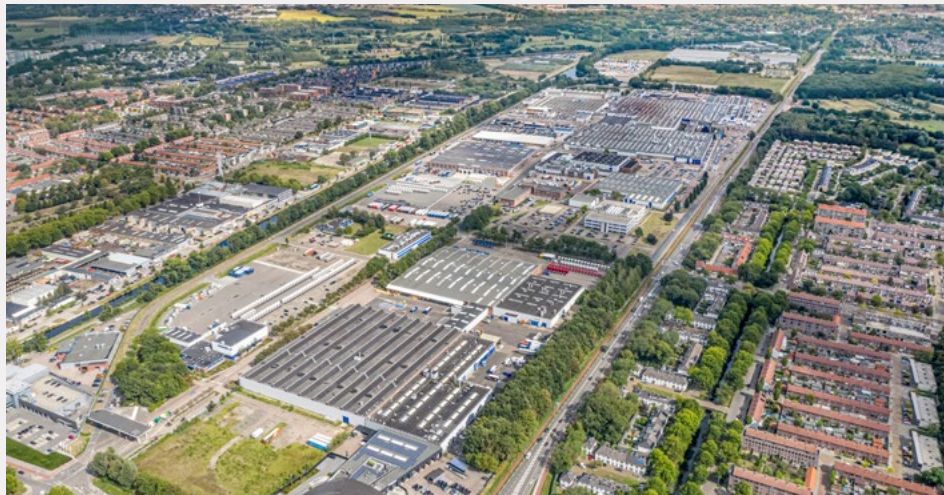
DAF's Eindhoven plant covers a total surface area of over 1,000,000 square meters.