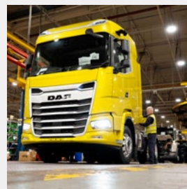
The Leyland assembly plant in Lancashire, United Kingdom.