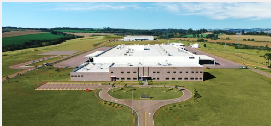
The 28,000 square metres facility in Ponta Grossa produces CF and XF vehicles for Brasil, as well as other South-American countries.

DAF products are manufactured in Eindhoven (the Netherlands), Westerlo (Belgium), Leyland (UK), Ponta Grossa (Brasil), Bayswater (Australia) and Taichung (Taiwan). Production of engines, cabs, axles and chassis as well as final vehicle assembly are integrated in the various facilities. Westerlo is the home of DAF's axle and cab factory. Leyland is the manufacturing site for DAF's light and medium duty XB vehicle range, as well as heavy duty XD, XF, XG and XG+ models.