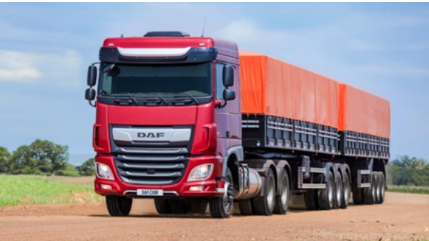
DAF Brasil produced a record 10,700 trucks in 2024 and achieved a strong 9.9% market share in the 16+ tonne segment. DAF Brasil has over 42,000 trucks in service throughout the country.

DAF sold more than 4,800 trucks outside the EU and Brasil in 2024, doubling sales in Jordan and the UAE markets and increasing market share in New Zealand. DAF Brasil produced a record 10,600 trucks in 2024 and achieved 9.9 percent market share in the 16+ tonne segment. DAF Brasil has over 42,000 trucks in service throughout the country. DAF Brasil introduced new vehicles designed for the mining, logging and construction industries