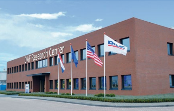
The Eindhoven based Engine Test Center is instrumental in expanding PACCAR's leading position in engine development.

On the road to an even cleaner future, DAF is offering a series of battery electric XB, XD and XF vehicles. Hydrogen technology is researched as a promising powertrain solution for the longer term. In addition, DAF is also further developing the highly efficient, clean diesel engines.