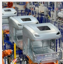
DAF's axle and cab factory in Westerlo, Belgium.